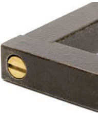
STEEL + FLAT BRASS