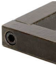
STEEL + HEX BLACK