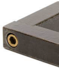
STEEL + HEX BRASS