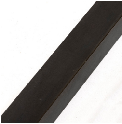
POWDER COATED STEEL