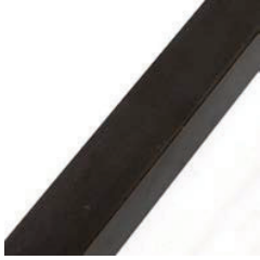
POWDER COATED STEEL