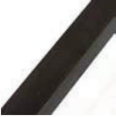
POWDER COATED STEEL